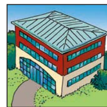
At your office . . .

PROS: Live digital feed and 24/7 Internet access for the next six months; accessible in the office, at home or anywhere worldwide with Internet access; avoid travel expense and hassle; no time away from the office.