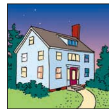
. . . or home