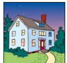
. . . or home