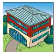
At your office . . .

PROS: Live digital feed and 24/7 Internet access for the next six months; accessible in the office, at home or anywhere worldwide with Internet access; avoid travel expense and hassle; no time away from the office.